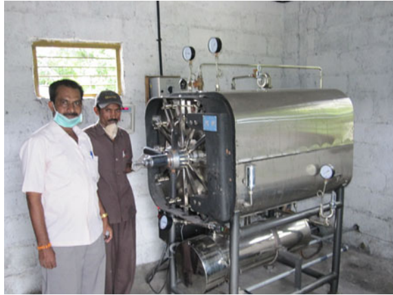
Fig. 6.13 Autoclave