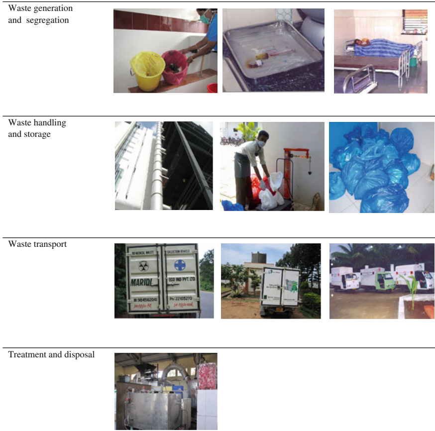
Fig. 6.4 Elements of biomedical waste management

not exceed 48 h during the winter and 24 h during the summer in warm climate regions, 72 h in cool season and 48 h in hot season in regions with temperate climate. Radioactive waste shall be stored in containers behind lead shielding and should be labelled depicting type of radionuclide, the date, and details of storage conditions required. Cytotoxic waste shall be stored away from other biomedical waste in secure location.