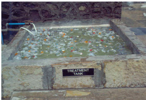
Fig. 6.16 Biomedical waste being chemically treated