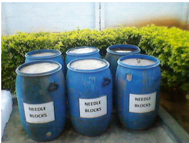
Fig. 6.7 Needle encapsulation