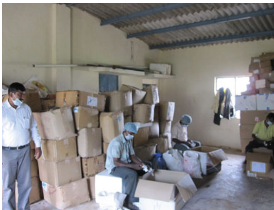
Fig. 6.10 Expired medicines being segregated from packaging prior to incineration

Figure 6.10 shows common disposal facility wherein pharmaceuticals are separated from their packaging materials. The metal/glass/plastic packing is usually separated to avoid load on disposal facilities. Pharmaceuticals need to be scientifically disposed of by high temperature (i.e. above 1,200 °C) incineration. Pharmaceuticals need particular attention during disasters as large quantities of pharmaceuticals are donated as humanitarian assistance demanding safe disposal if this assistance is unused.