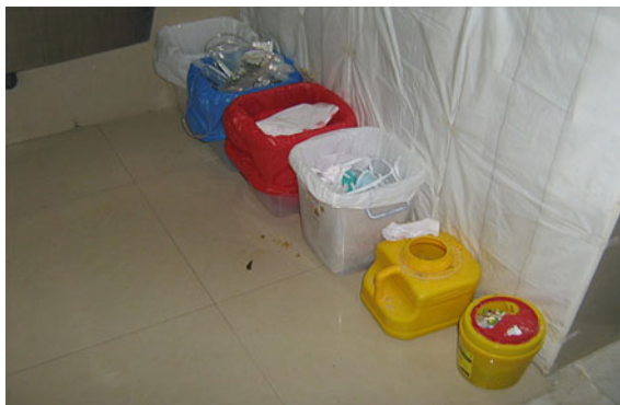
Fig. 6.5 A good practice of onsite segregation. The recycle waste like plastic, sharps and non infected waste shall be segregated to avoid generation of dioxins and furans due to combustion of all the waste and avoid increase in infected waste due to contact between infected and non-infected waste

storage area from where different categories of waste will be collected and transported to a common treatment facility. Failure to segregate infected waste at source may lead to rise in treatment and disposal cost as all the waste needs critical treatment and disposal methods to avoid spread of infection. The entry of mercury, lead and radioactive substances will have direct implication in terms of release of these heavy metals and radioactive substance into air, water, food and soil damaging flora and fauna and physic-chemical components of environment.