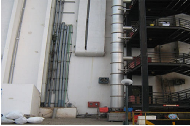
Fig. 6.6 Chute conveyor in modern hospital to transfer waste from individual wards in different floors to centralized storage area from where different category of waste will be collected and transported to common treatment facility

mercury which is toxic and generate immense amount of mercury vapours and waste while handling them, (4) department of peroidontics: major wastes in this department are tissues and scalpels and blades, (5) department of oral and maxillofacial surgery: this department generates extracted teeth, extracted teeth with amalgam, (6) department of prosthodontics: this department generates plaster of paris , stone casts, waxes and acrylic resins, (7) department of pedodontics: this department generates extracted teeth (8) department of orthodontics: this department generates orthodontic bands and arch wires-overnight immersion in 2 % glutaraldehyde.