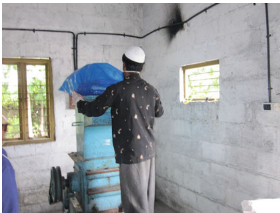
Fig. 6.14 Biomedical waste being fed into the shredder