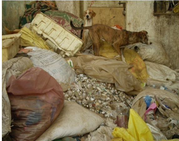
Fig. 6.1 Biomedical waste stored unscientifically for recycling

Group III—comprises of contaminated wastes, or potentially contaminated waste, and