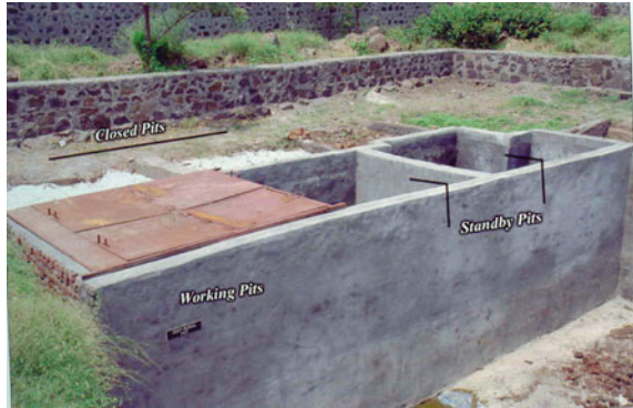
Fig. 6.15 Biomedical waste deep burial facility

secretions/excretions of infected birds. Avian flu outbreak during 2003 and 2004 resulted in the death/destruction of 44 million Birds and 29 million birds, in Vietnam and Thailand respectively. As of mid-2006, about 200 million domestic birds had either died or culled (FAO 2012).